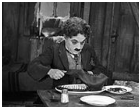
THE TRAMP IS CARVING UP A BOOT.

I recently watched two movies from my Netflix queue: Charlie Chaplin in The Gold Rush (1924) and John Wayne in Island in the Sky (1953). In The Gold Rush , Charlie Chaplin is a Yukon prospector in 1898 who falls in love, eats a shoe (a weird reference to the Donner Party's desperation in eating the boiled hides of their cattle), doesn't fall off a cliff, and doesn't strike it rich. The opening scene is of hundreds of miners trudging up towards Donner Summit, echoing the great numbers of men who trekked up mountains in Canada to get to the gold deposits. Other scenes that were shot in Truckee ended up on the cutting room floor, but the craggy mountains challenging the men at the start of the movie are our craggy mountains.