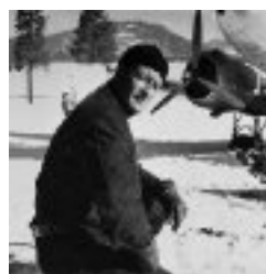
PHOTO DATE: 1953

Truckee's Boca Mountain served as much of the backdrop in Island in the Sky , representing the windy, heavily forested land of Labrador. John Wayne pilots a plane that he must land in a storm, which he does with no immediate loss of life, but the aircraft's radio is damaged and cannot provide accurate coordinates to the search parties that quickly disperse to locate the crash. The movie cuts between the crash site with the freezing, starving men of John Wayne's crew and the airbase and pilots conducting the search missions. During filming in 1953, Truckee's airport was located just south of where the agricultural inspection station now is on Interstate 80. Features of that old airport may be distinguishable in the movie to someone who had been very familiar with it, but of course our modern airport replaced the old airstrips several decades ago.