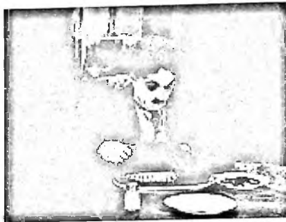
THE TRAMP IS CARVING UP A BOOT.

I recently watched two movies from my Netflix queue: Charlie Chaplin in The Gold Rush (1924) and John Wayne in Island in the Sky (1953). In The Gold Rush , Charlie Chaplin is a Yukon prospector in 1898 who falls in love, eats a shoe (a weird reference to the Donner Party's desperation in eating the boiled hides of their cattle), doesn't fall off a cliff, and doesn't strike it rich. The opening scene is of hundreds of miners trudging up towards Donner Summit, echoing the great numbers of men who trekked up mountains in Canada to get to the gold deposits. Other scenes that were shot in Truckee ended up on the cutting room floor, but the craggy mountains challenging the men at the start of the movie are our craggy mountains.