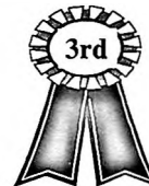
Calendar of events