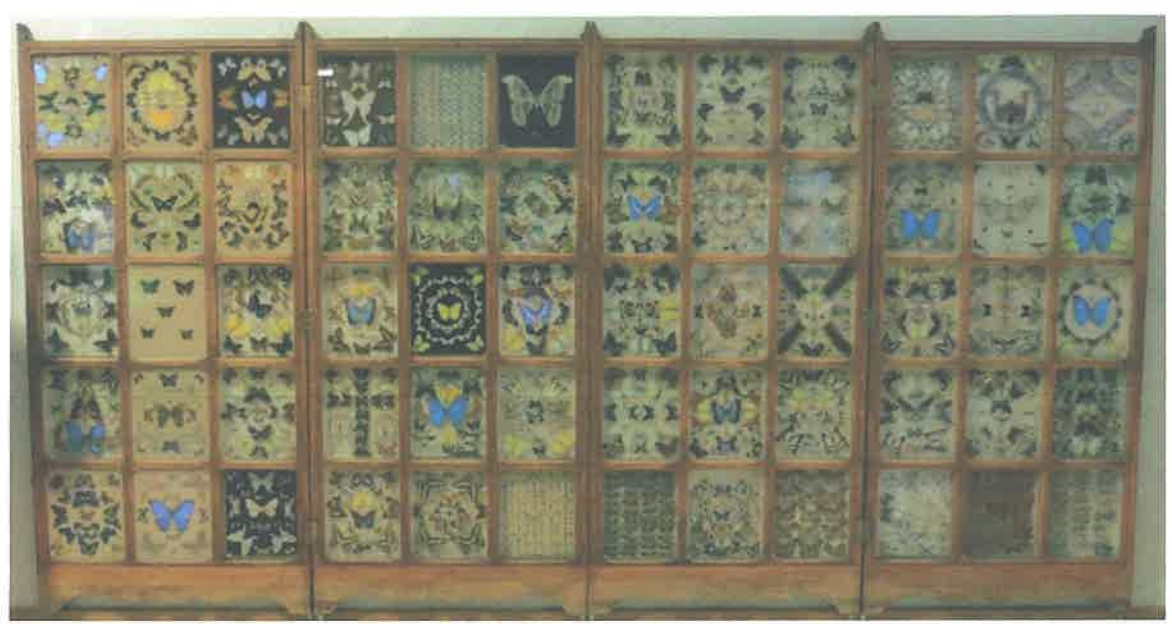
Since Spring 2015, Collection now on display at the TDRPD