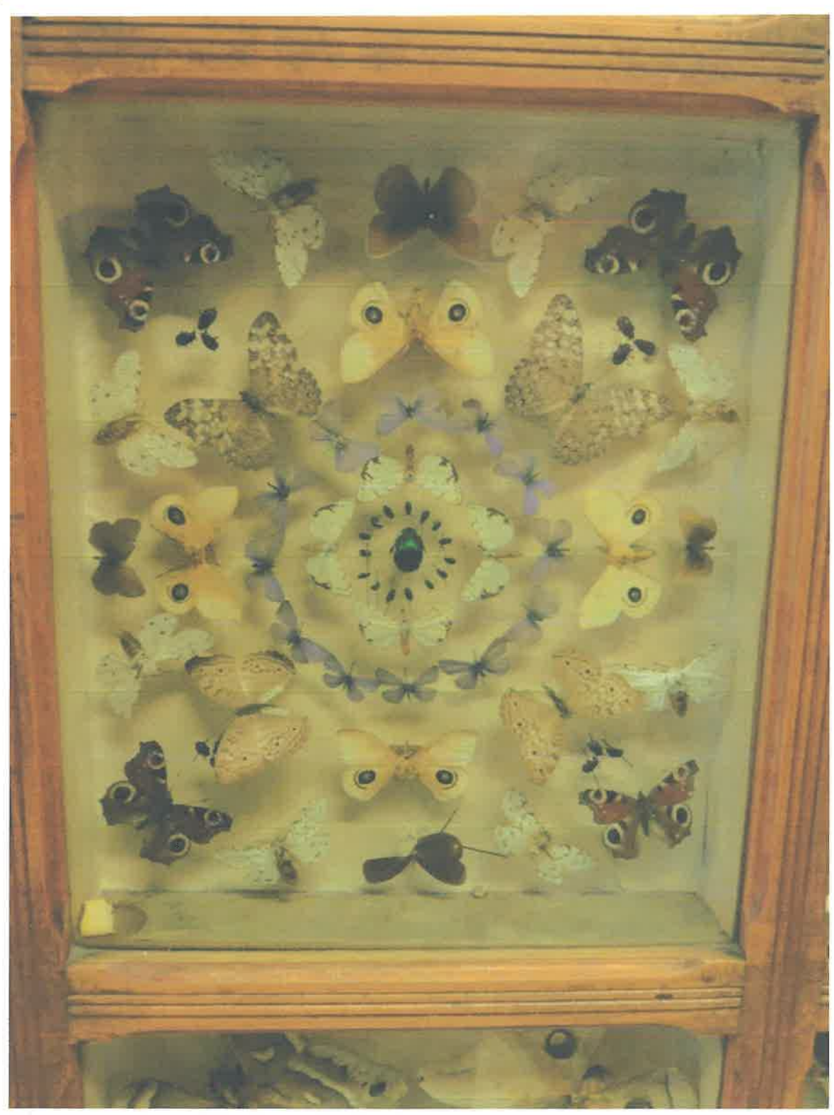
Close up on two of the Butterfly Displays