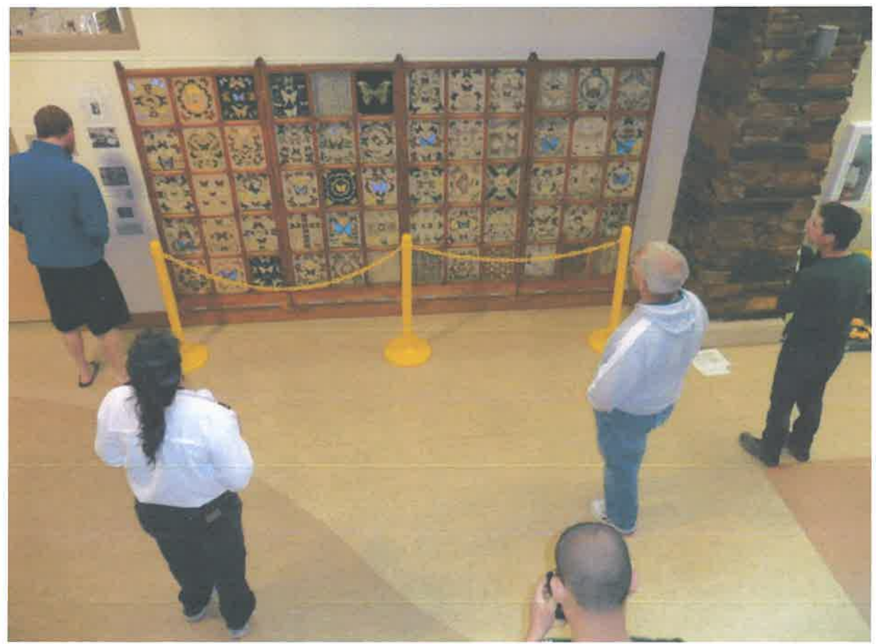
McGlashan Butterfly Collection installation at TDRPD Spring 2015