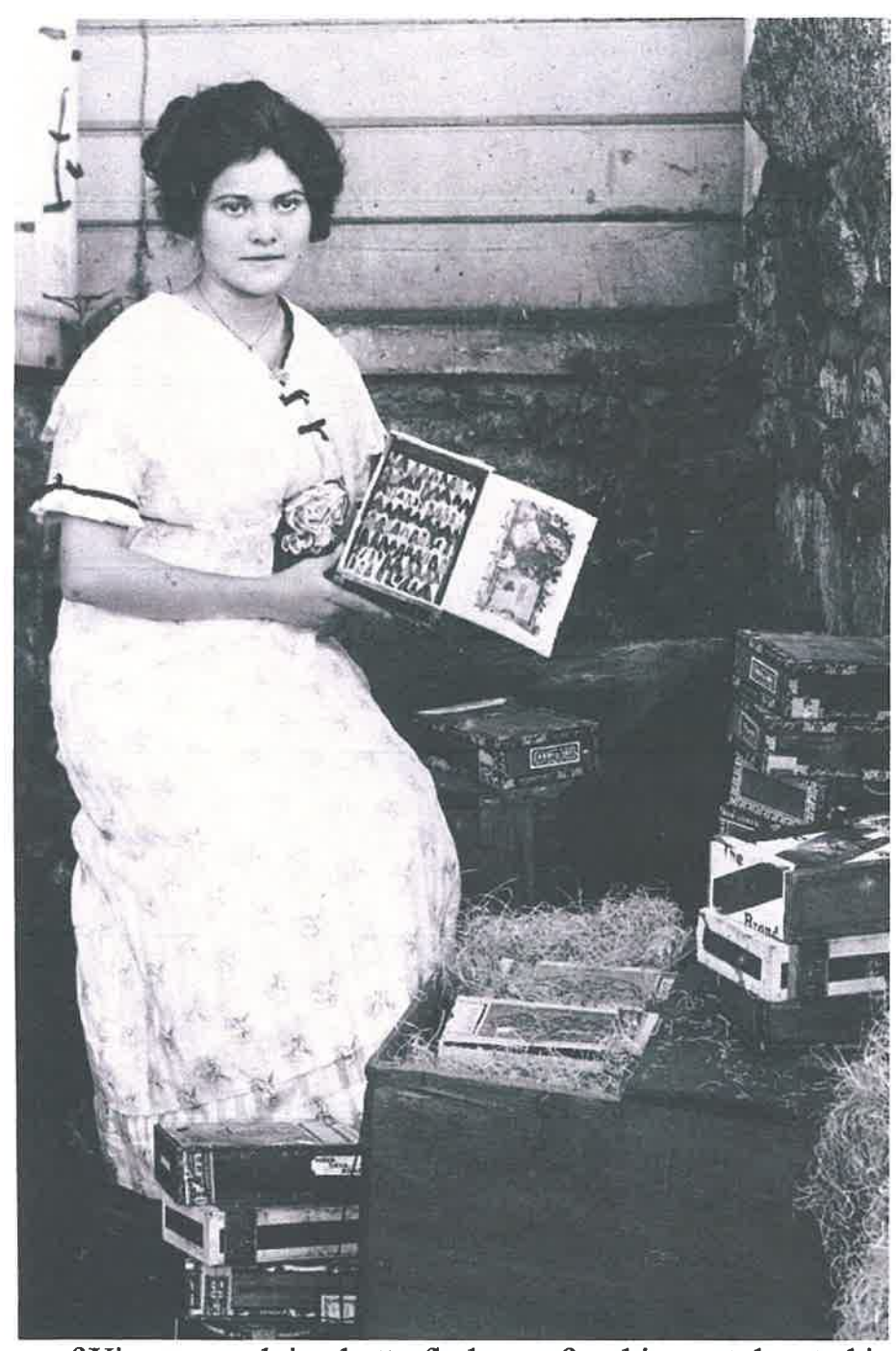
1912 picture of Ximena readying butterfly boxes for shipment; located in Jeannine Oppewall article, "History of Butterfly Farming in California" (Winter 1998), published in American Entomologist and TERRA magazine (Spring 1979 Vol. 17, No. 4).