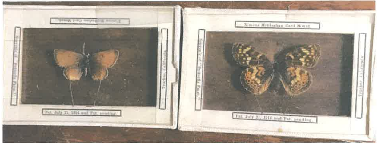
Note Ximena McGlashan card mount and Pat. Pending notation July 21, 1914.