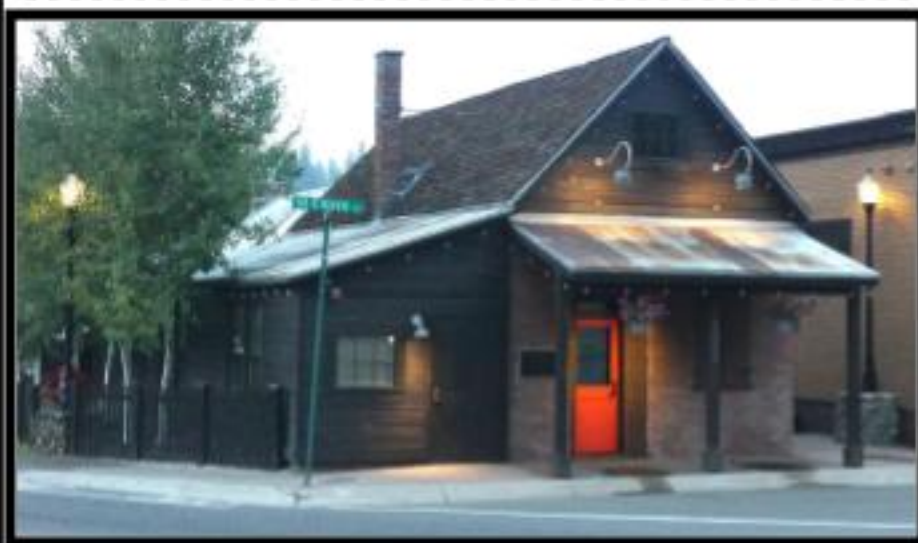
The only remaining Chinese building in town, and part of the second Chinatown located over on Southeast River Street