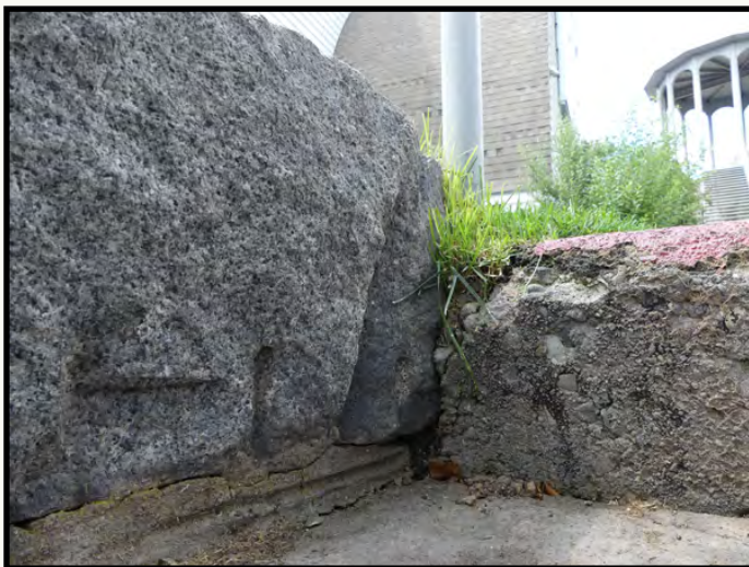
(Above) More evidence on McGlashan retaining wall of Plug and Feather; again note Rocking Stone Tower is in the top right corner