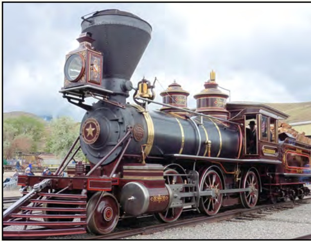
(Above) Train Glenbrook Steam Engine May 23, 2015 By Greg Zirbel - Restored

Come visit the Truckee-Donner Historical Society and see the original 1888 Commissioners Rail Road map and learn more about our historic community.