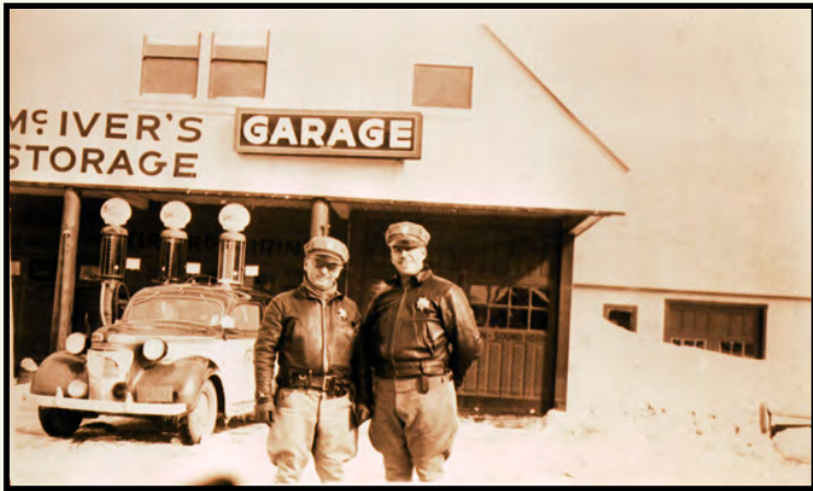
McIver's Garage stood where Donner Pass Road now runs between The Truckee Hotel and the Beacon Station (BCS095)