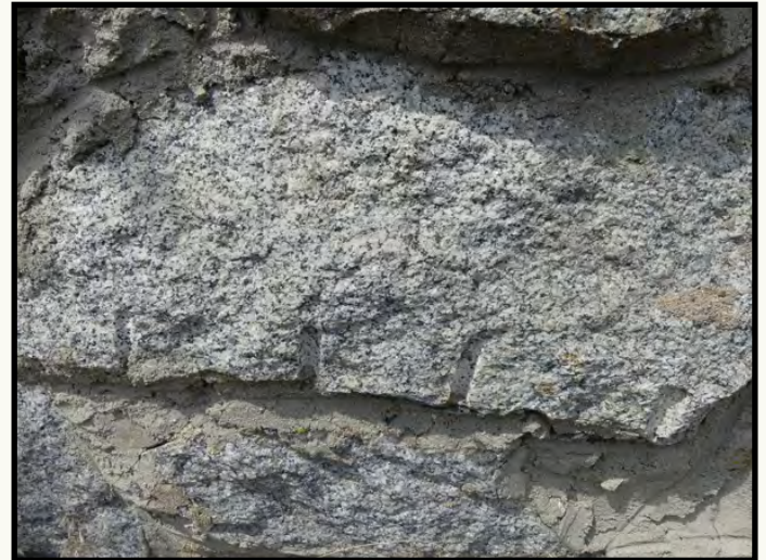
(Above) More evidence at McGlashan retaining wall