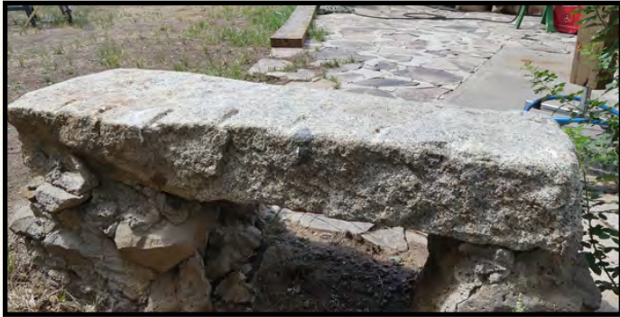
(Above) Sassarini home