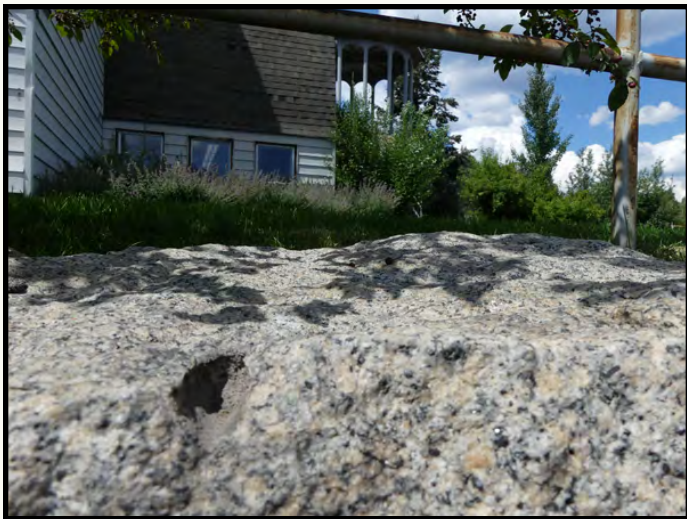
(Above) McGlashan retaining wall; note Rocking Stone Tower visible in middle back of photo